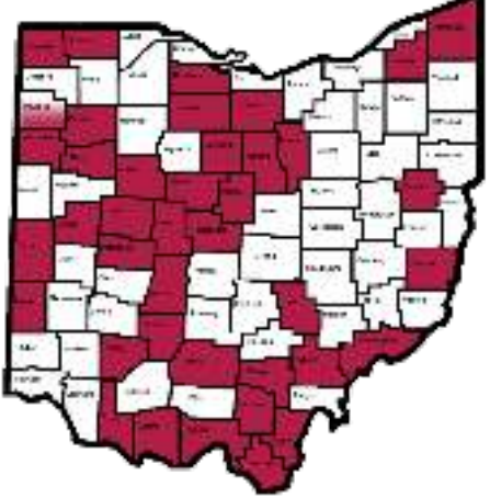
CEBCO Member Counties

Scheduled for April 3 at 10 a.m., at the Columbus Airport Embassy Suites. We encourage commissioners, as well as, appropriate administrative staff to attend. The program will